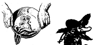
The old miner sez: Lookie thet elusive yelloh metal. Wooden it be grate ifin ya had sumpin like thet zinging yer tector?