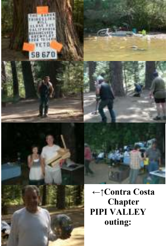
←↑Contra Costa Chapter PIPI VALLEY outing: