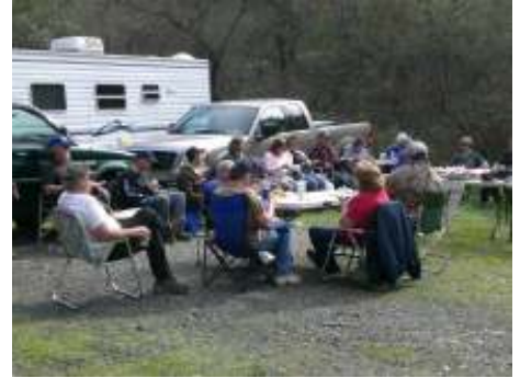
March 24, 2012 - Moccasin Creek Potluck